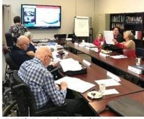
OARC's November Board Meeting