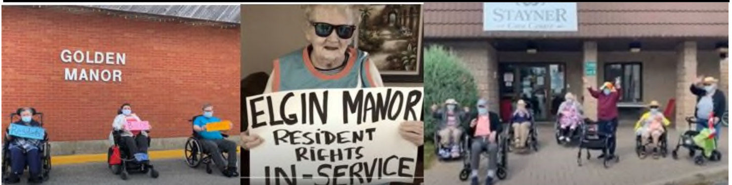
(Pictured above from left to right): RBR Video Challenge Top Prize Winners: Golden Manor (Timmins), Elgin Manor (St. Thomas) and Stayner Care Centre (Stayner). Thank you to all who contributed to this special contest!

Creating an educational video is just one way that residents can work together with team members to bring the Bill of Rights to life. When residents are empowered as teachers and team members see the people 'behind the rights' this approach to education brings renewed meaning to mandatory training. To put a fresh spin on residents' rights education at your home, consider OARC's Through Our Eyes Program resource—every home has a hardcopy or you can access it online: https://www.ontarc.com/education-support/through-our-eyes.html