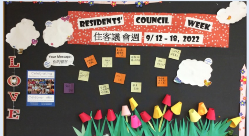
YEE HONG CENTRE, MARKHAM