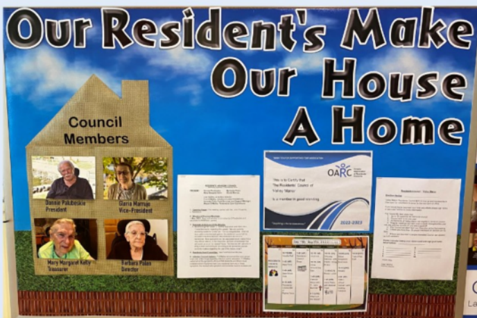
VALLEY MANOR, BARRY'S BAY