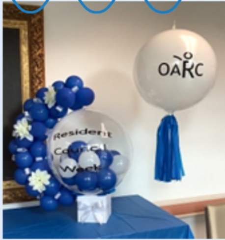
QUEEN'S GARDEN, HAMILTON