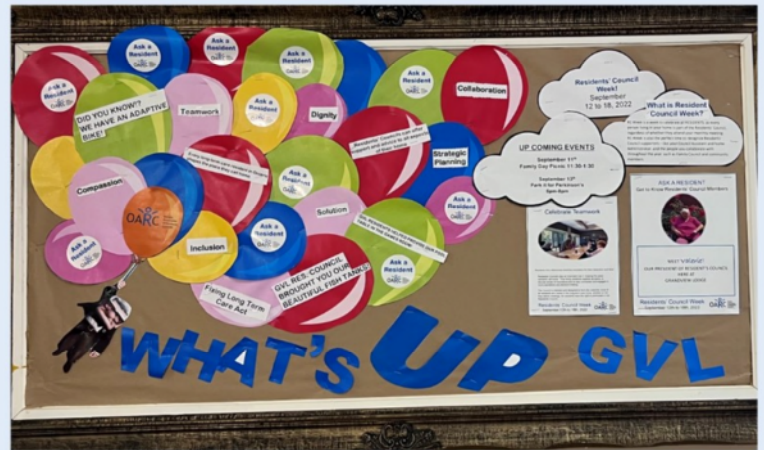
GRANDVIEW LODGE, DUNVILLE